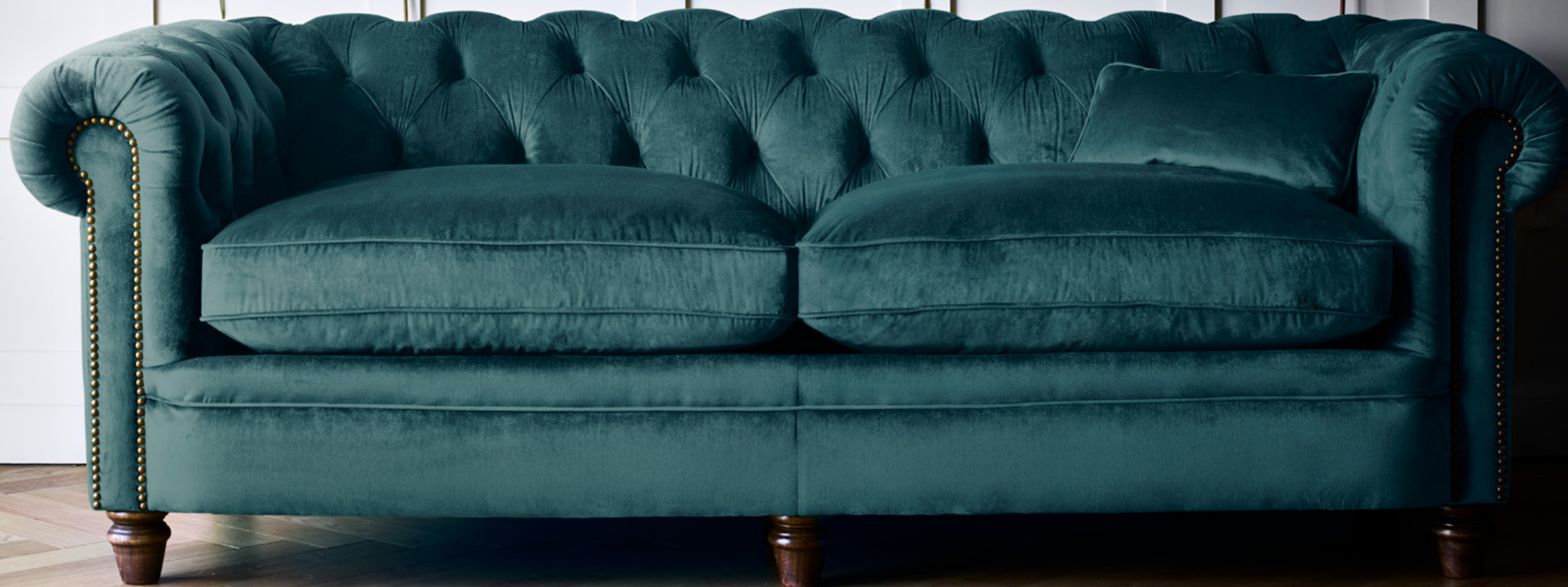
ABRAHAM JUNIOR GRAND SOFA IN PLUSH PEACOCK WITH DARK WOOD FEET