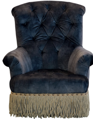
BELLA CHAIR SHOWN IN BABETTE COAL WITH ANTIQUE FRINGE W: 84cm H: 105cm D: 99cm