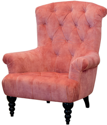
ELLA CHAIR SHOWN IN BABETTE SUNSET W: 84cm H: 105cm D: 99cm

A throne fit for a princess or prince, neat pleated arms and high chic button back design creates the ideal spot to rest one's weary head after a day at the office, or palace. Add a flirtatious edge with a fringed skirt and transform your Ella into Bella!