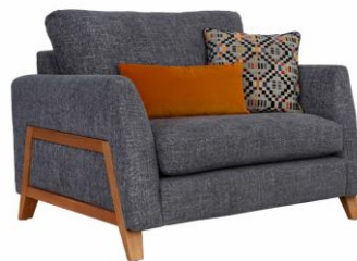
Mayfair Chairs and Snuggler Chairs do not include scatter cushions. All scatter cushions are available to purchase separately.