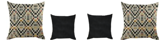
4 Cushion Pack - Medium Sofa