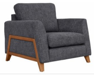
Model: Mayfair Chair Fabric: Millie Shadow Wood Colour: Oak