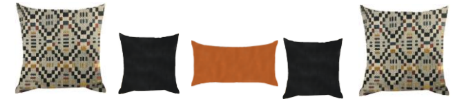
5 Cushion Pack - Large Sofa