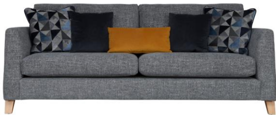
Model: Mayfair Large Sofa Fabric: Millie Shadow Cushion Pack: Harlequin Cobalt Wood Colour: Oak