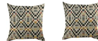
2 Cushion Pack - Small Sofa