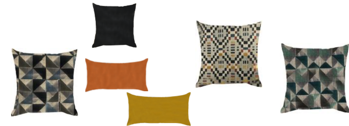
Individual cushions are available to buy