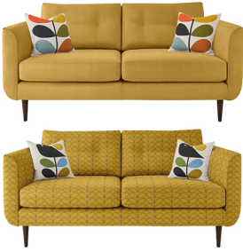
Plain or pattern all over