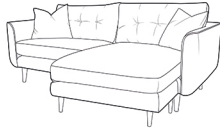
Large Chaise Sofa (interchangeable left/right hand facing) H87 x W215 x D152cm