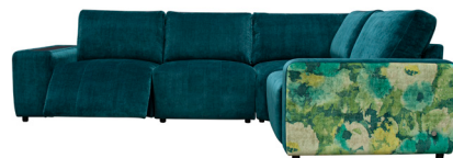
2 Corner 1 with LHF Storage Power Footrest (4 parts)

All measurements are approximate and relate to the overall size of the item including soft arm cushions where fitted and back cushions. All Chairs & RHF Units feature the Jay Blades signature pink panel on RHF side of the inside back. All Chairs, Footstools & LHF units come with a Jay Blades branded badge with the exception of storage units which will not feature a Jay Blades Badge. Available in a range of Fabrics, Leathers & Accent Fabrics. LHF/RHF Units, LHF/RHF Units with Power Footrest & Chairs are available in one Fabric or Leather as well as a Two Fabric Story option. All storage units and swivel footstools come in Dark Wood as standard. Seat cushions are a fixed-type. Back cushions are made using 100% recyclable polyester fibre from recycled plastic waste.