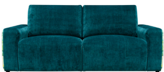
LHF/RHF Sofa (2 parts)