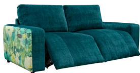
LHF/RHF Sofa with Double Power Footrest (2 parts)