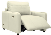
Chair with Power Footrest