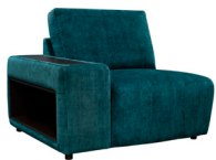
LHF/RHF Storage Unit