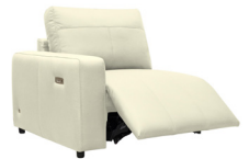
LHF/RHF Unit with Power Footrest