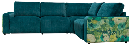
2 Corner 1 Static (4 parts)