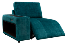
LHF/RHF Storage Unit with Power Footrest