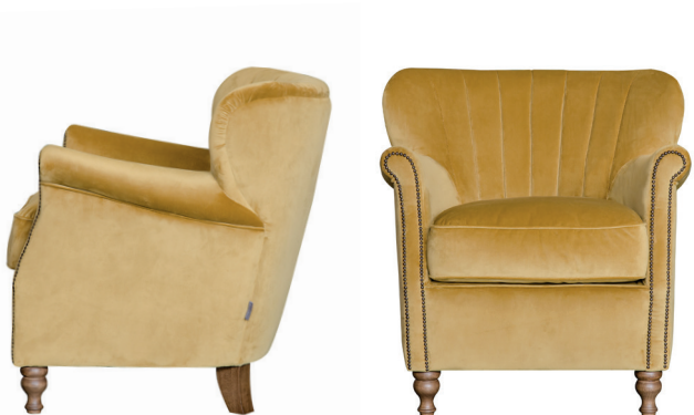
PERCY CHAIR SHOWN IN PLUSH OCHRE W: 70cm D: 75cm H: 74cm

Percy is a petite modern classic chair. Hand crafted to fit into any space and designed to suit a variety of our natural leathers and fabrics.