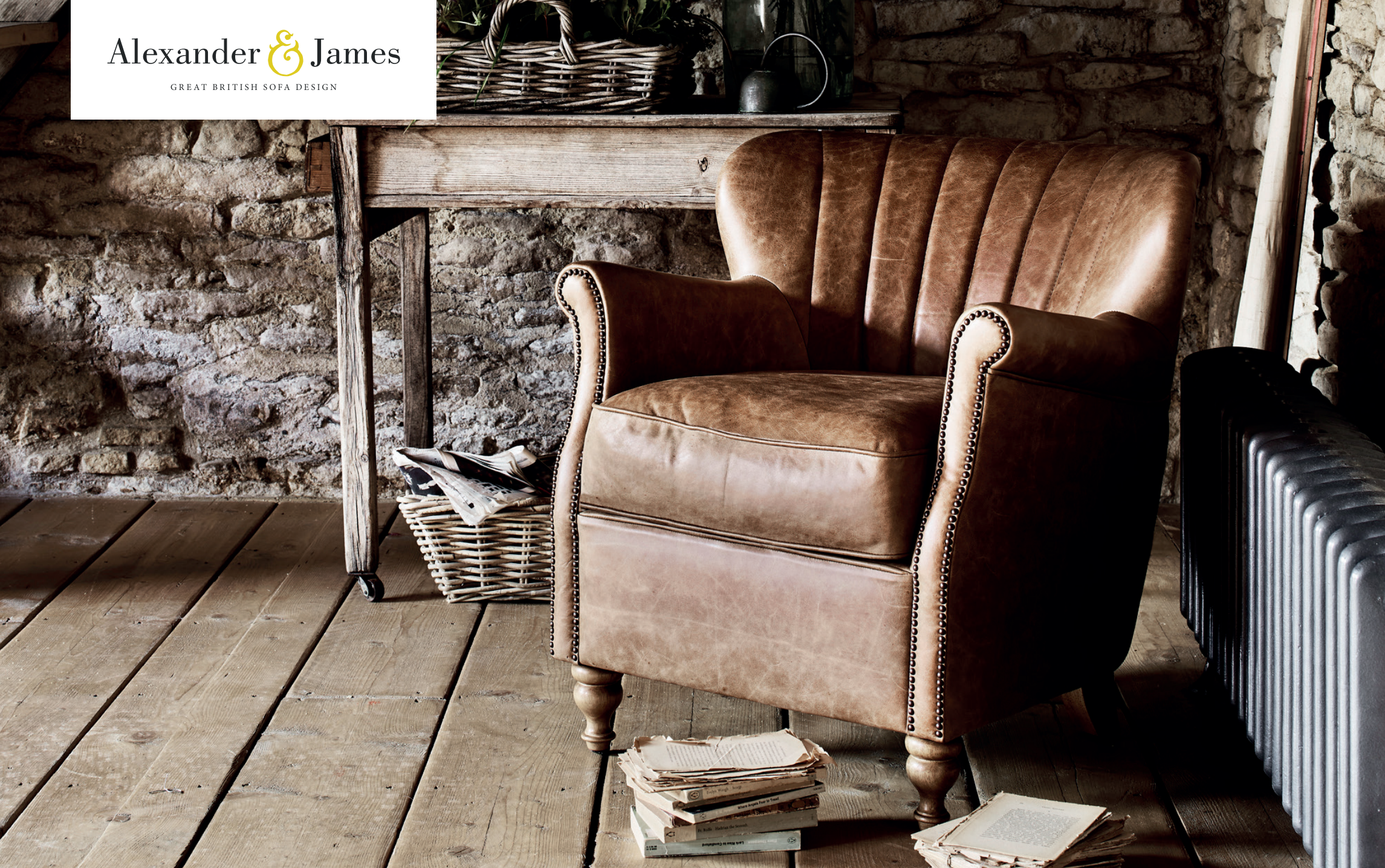
PERCY CHAIR SHOWN IN SACHEL LATTE AND WEATHERED OAK FEET

Alexander & James GREAT BRITISH SOFA DESIGN