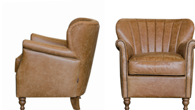
PERCY CHAIR SHOWN IN SACHELL LATTE W: 70cm D: 75cm H: 74cm