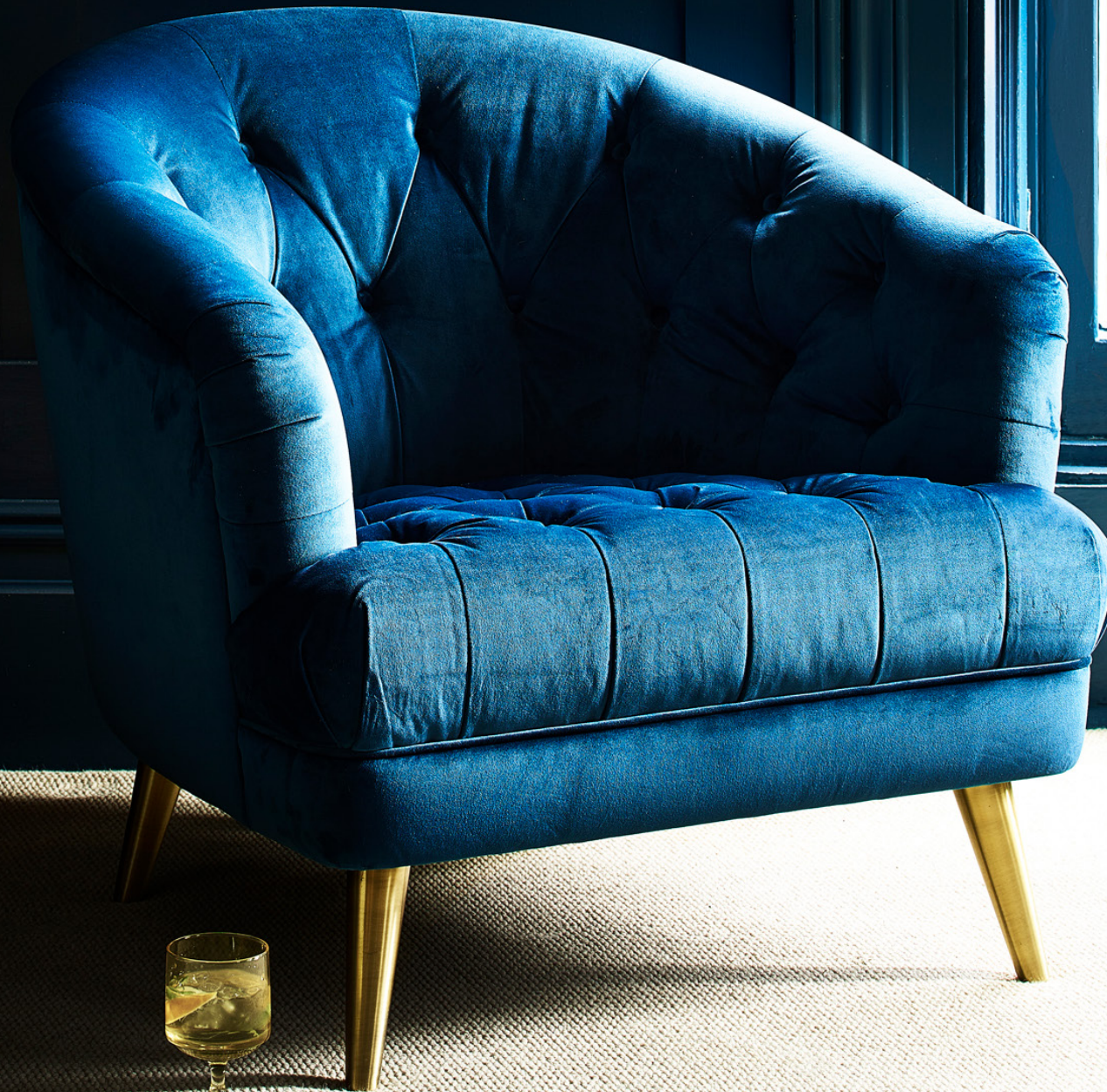
FLORENCE CHAIR SHOWN IN PLUSH TEAL WITH GOLD METAL FEET