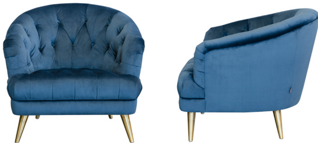
THE FLORENCE CHAIR

Elegant accent chair with neat pleated arms and hand tufted buttons. Chic, slim legs add decadence to the chair.